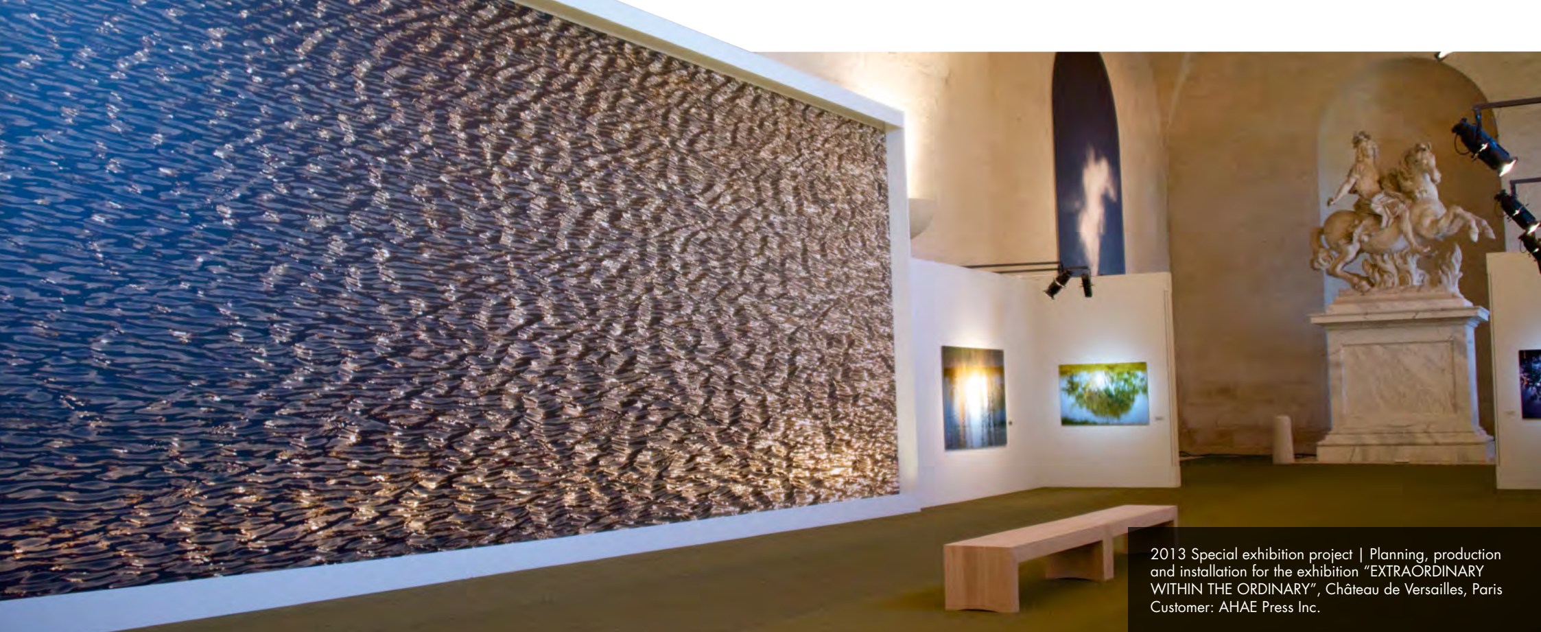
2013 Special exhibition project | Planning, production and installation for the exhibition "EXTRAORDINARY WITHIN THE ORDINARY", Château de Versailles, Paris Customer: AHAE Press Inc.