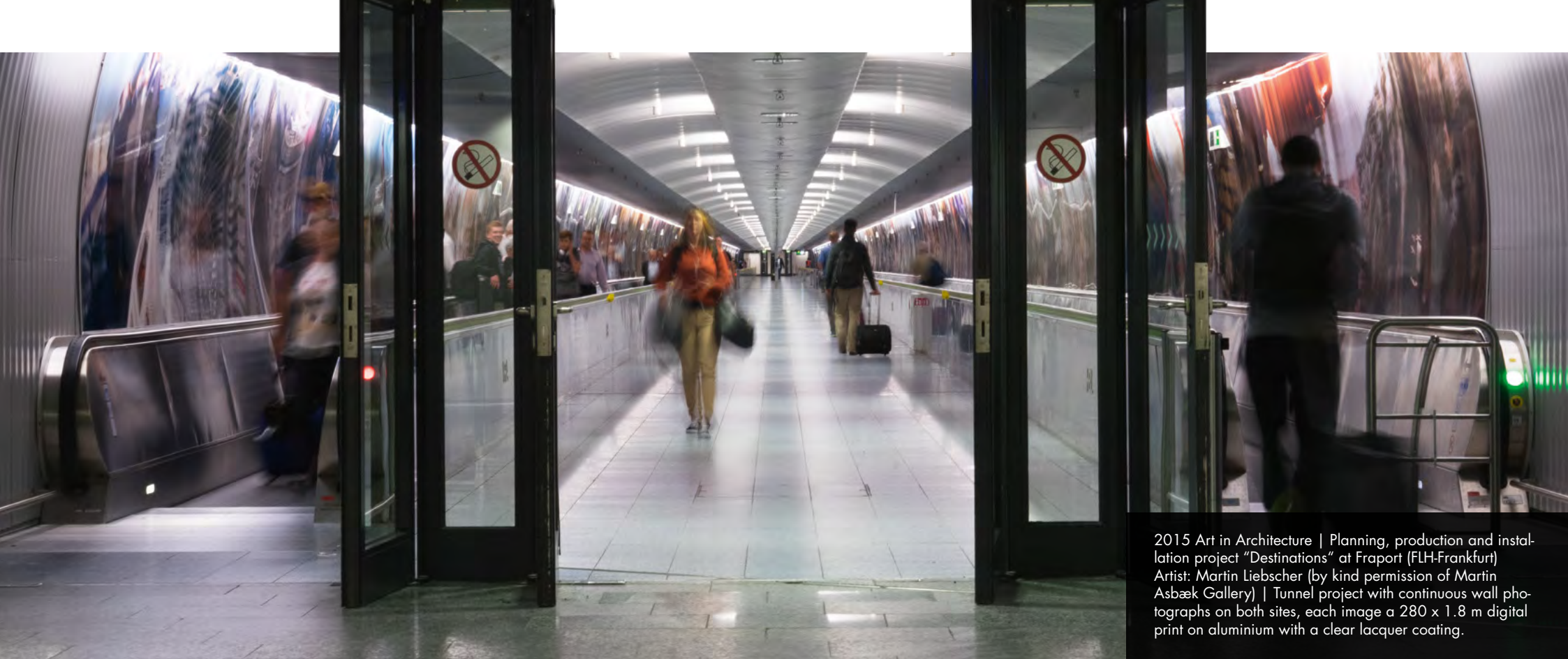
2015 Art in Architecture | Planning, production and installation project "Destinations" at Fraport (FLH-Frankfurt) Artist: Martin Liebscher (by kind permission of Martin Asbæk Gallery) | Tunnel project with continuous wall photographs on both sites, each image a 280 x 1.8 m digital print on aluminium with a clear lacquer coating.