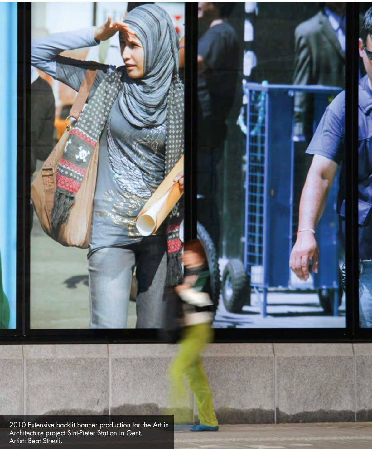
2010 Extensive backlit banner production for the Art in Architecture project Sint-Pieter Station in Gent. Artist: Beat Streuli.